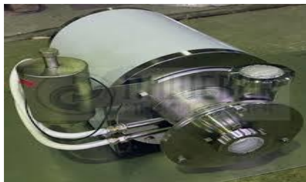
Figure 2. Rotor-pulsating device

Increasing the dispersion of starting materials in RPAs is carried out up to 8000 cm 2 /g and more. As a result, the efficiency of modern technologies increases dramatically, energy consumption is significantly reduced, technological and physico-chemical properties of materials are improved.