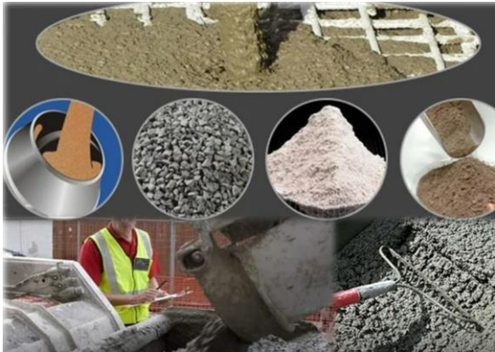
Figure 1. Tiny additional materials

In Group 1-chemicals, a small amount (0.1-2% cement mass) is added to the concrete composition to change the concrete mixture and the nature of the concrete to the desired side.